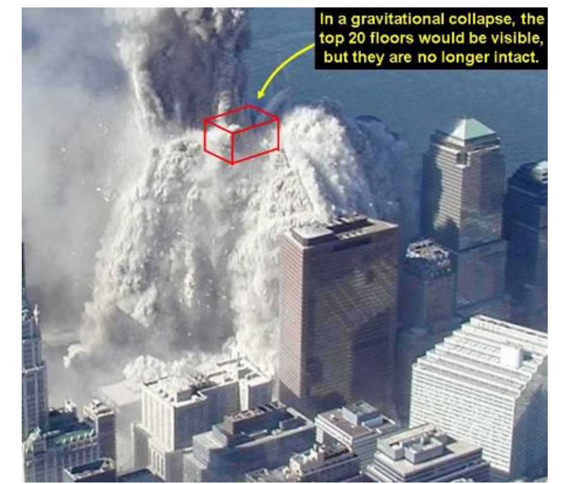
Figure 4: Aerial View of the North Tower