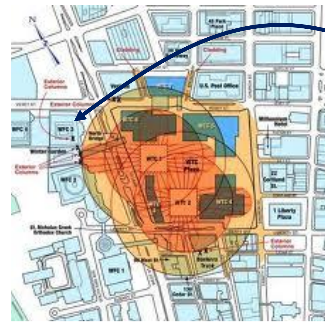
Figure 5: 1200 foot Diameter Debris Field Centered Around Each Tower.

The evidence for a gravity-only collapse is non-existent because the building mass remaining within the footprint of the building at the conclusion of the destruction, estimated at only about 10 percent, was insufficient to have destroyed and violently pushed aside the undamaged lower 90 floors.