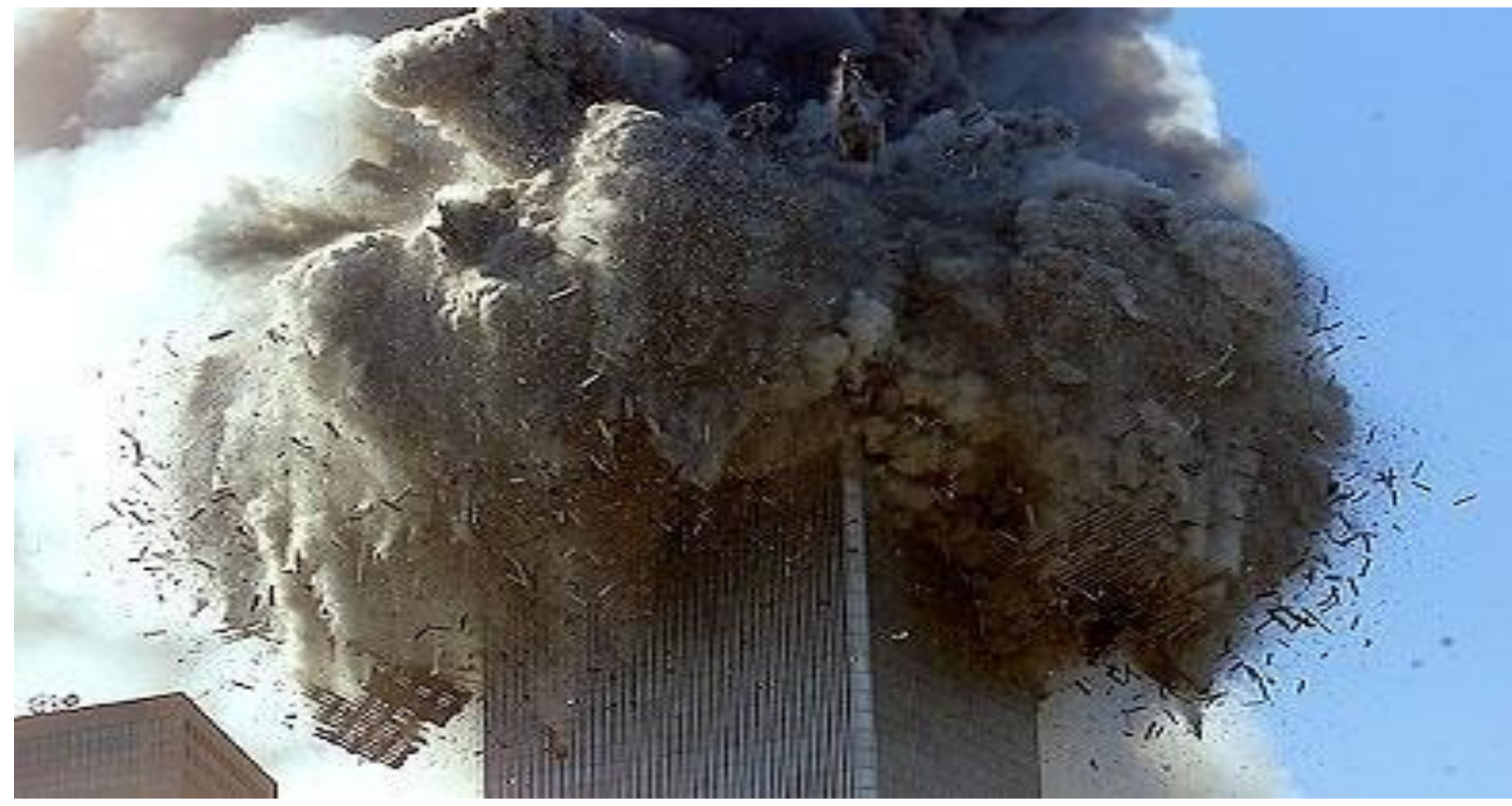
Figure 3: North Tower Destruction - Side View