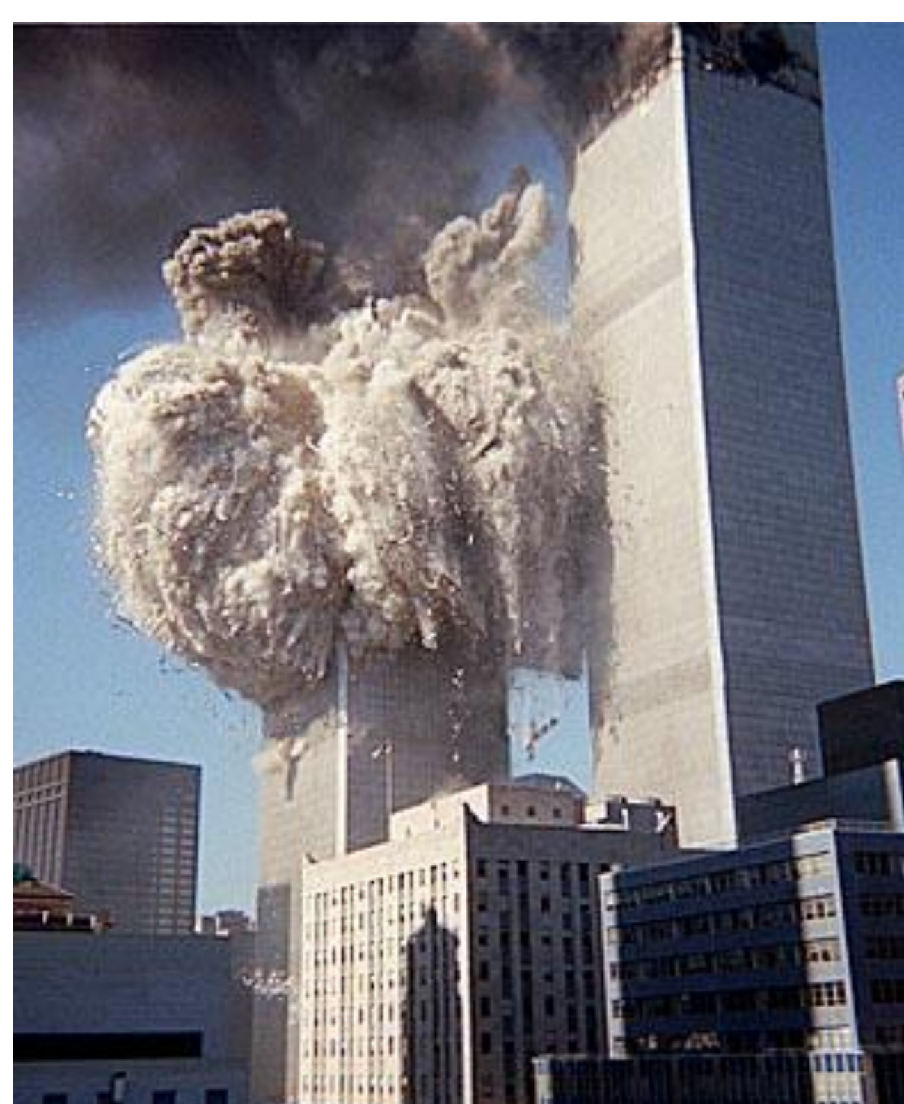
Figure 2: South Tower Destruction Showing Lateral Ejections in all Directions and the Debris Curtain Beginning to Obscure the Demolition Wave (taken shortly after t = 2.20).

Figures 3 and 4 show the destruction of the North Tower (WTC1). Again, the most salient observation is that the destruction is showing lateral ejection of materials in all directions. This behavior is not indicative of a mid-structure weakening followed by gradual deformation and an ensuing structural failure. Rather, it is consistent with explosive ejection and pulverization.