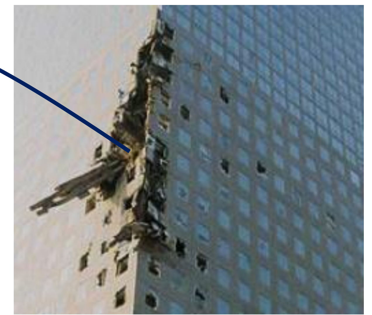
Figure 6: Structure From North Tower Ejected into World Financial Center Building 3.

Fourteen survivors, including members of the New York Fire Department, were in the fourth floor stairwell of WTC1 - the so called "Miracle of Ladder 6." Once the dust cleared, they reported looking up into the open sky instead of being buried under 110 stories of rubble.